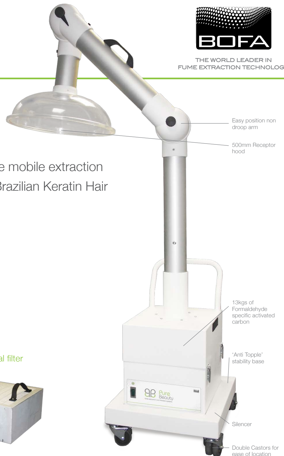
Deep bed chemical filter

The complete mobile extraction solution for Brazilian Keratin Hair Treatment.